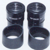
Eyepieces and guards